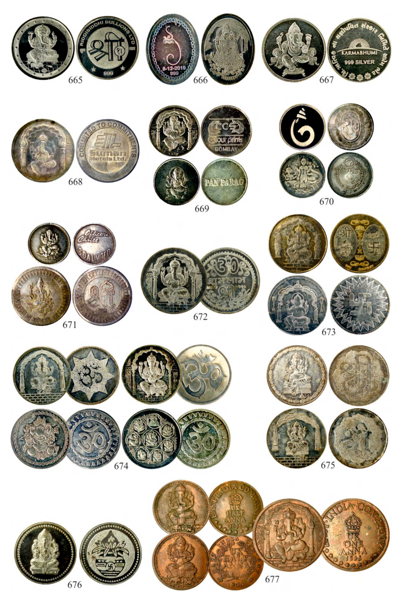
Rajgor's Auction No. 62 Bid in the Online Live Auction on: www.Rajgors.com