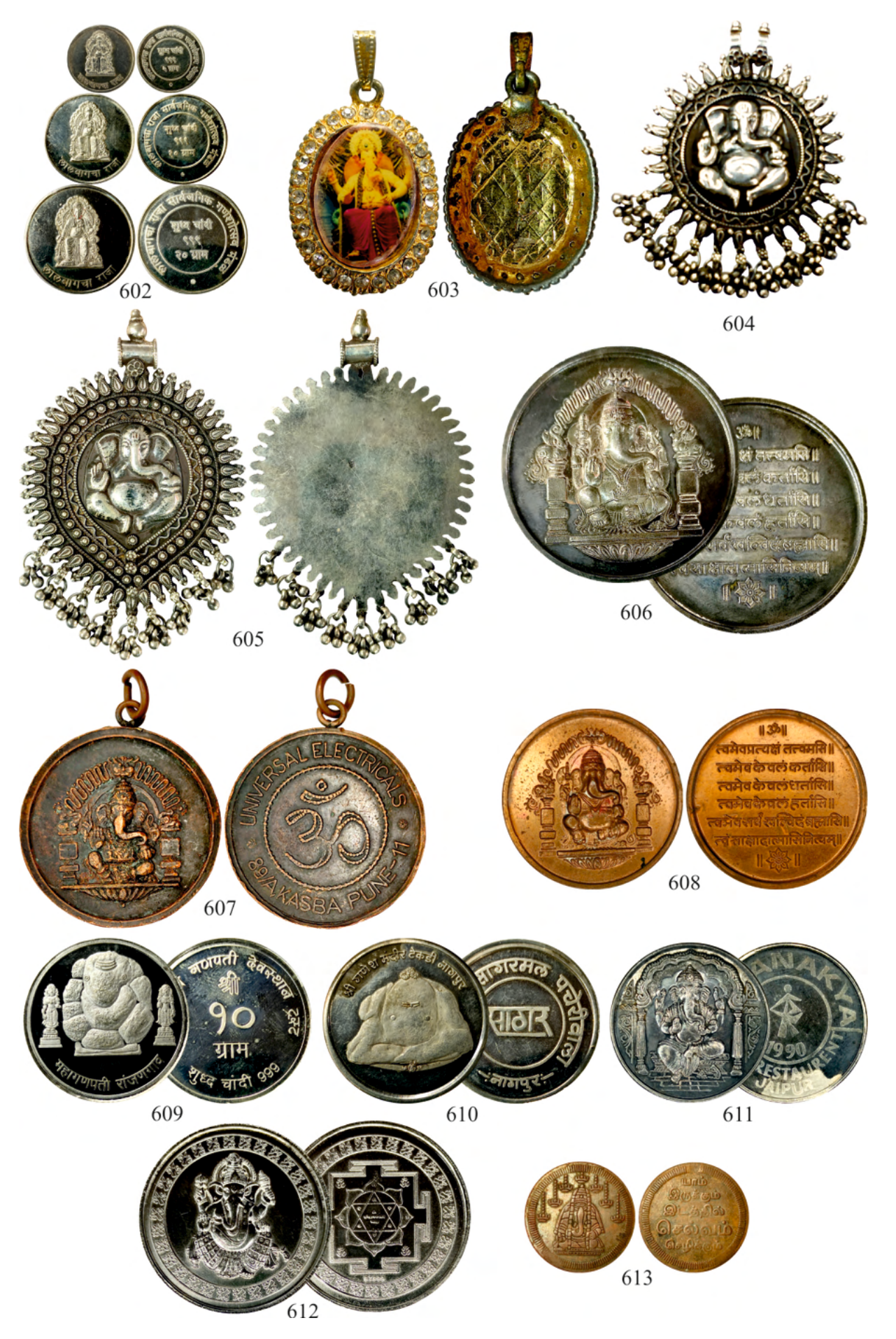
Rajgor's Auction No. 62 Bid in the Online Live Auction on: www.Rajgors.com